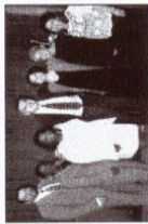
The diversity of UTMB's population is reflected in the diversity of its staff and students. UTMB is proud to host the "I Am Martin Luther King Jr." holiday celebration program.